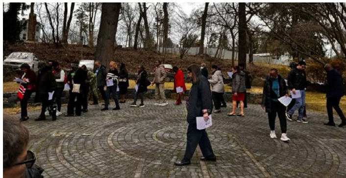
Fr. Mathew participated in an interfaith luncheon at the Woodlands Temple in January. The group discussed various interfaith programs.